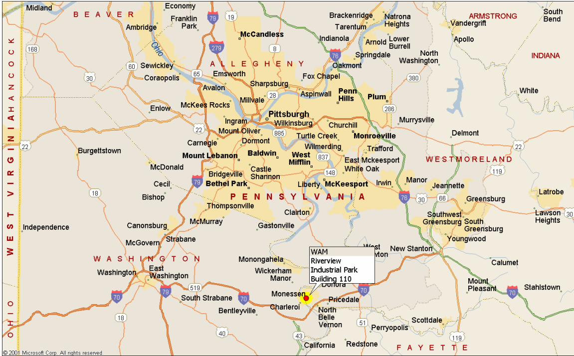
Westmoreland Advanced Materials, LLC Vicinity Map